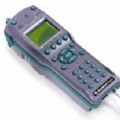
Application Note HOWTOPPPOE-4